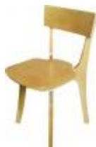
Bambino chair (B1)

Complete chairs for kids 1.5-8 years old or chair components. Polished/ unpolished