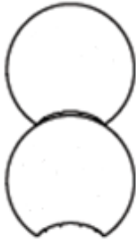
Machine rounded logs