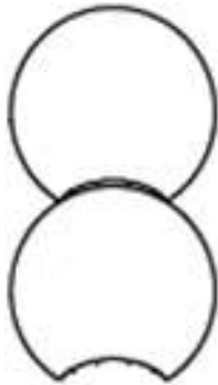
Machine rounded logs